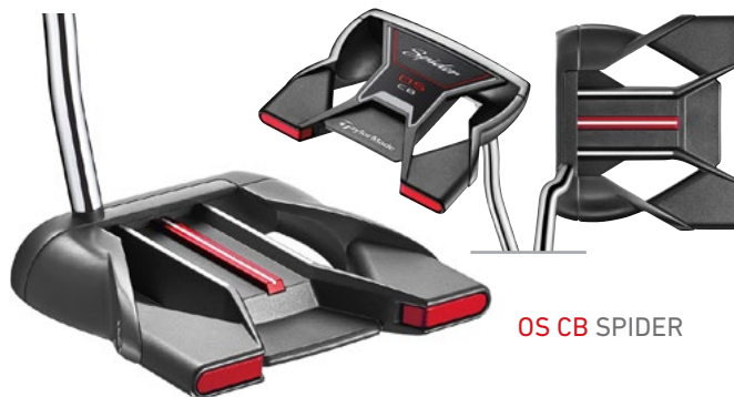
OS CB SPIDER