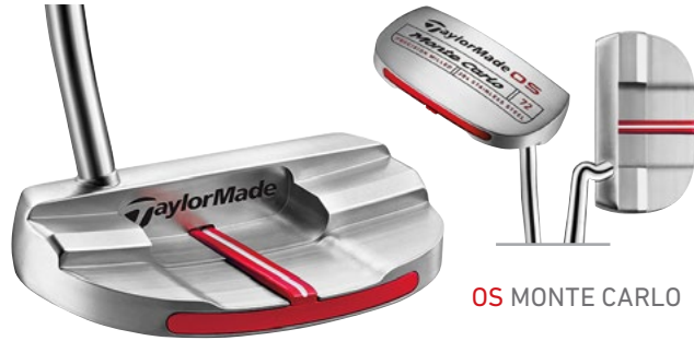
OS MONTE CARLO