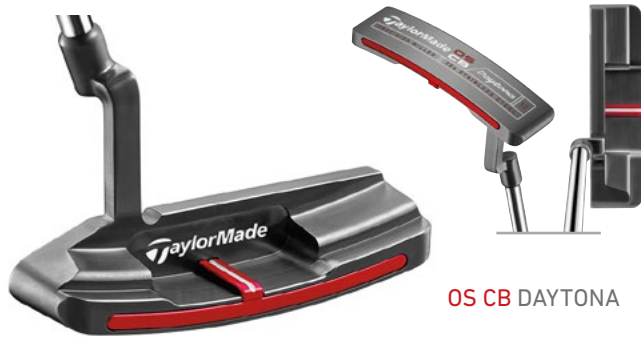
OS CB DAYTONA