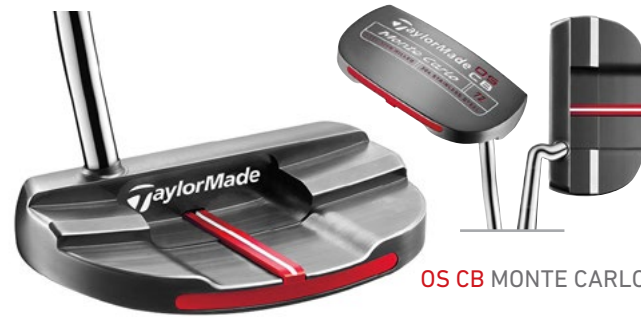
OS CB MONTE CARLO